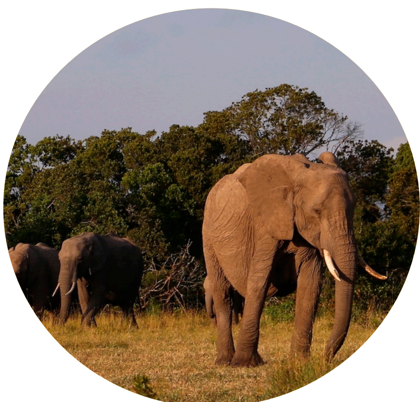
Sarada Camp or similar

On day 9 we have the whole day to explore Namunyak Community Conservancy. We might start the day with a guided walking safari with packed breakfasts in breathtaking settings or spend the morning beading with Samburu ladies and hear more about the cultural importance of their vivid jewellery before we honour an ancient Samburu tradition by visiting one of the famous Singing Wells or going on a game drive again.